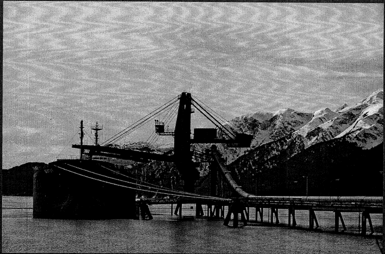
Seward, Alaska Coal Loading Facility