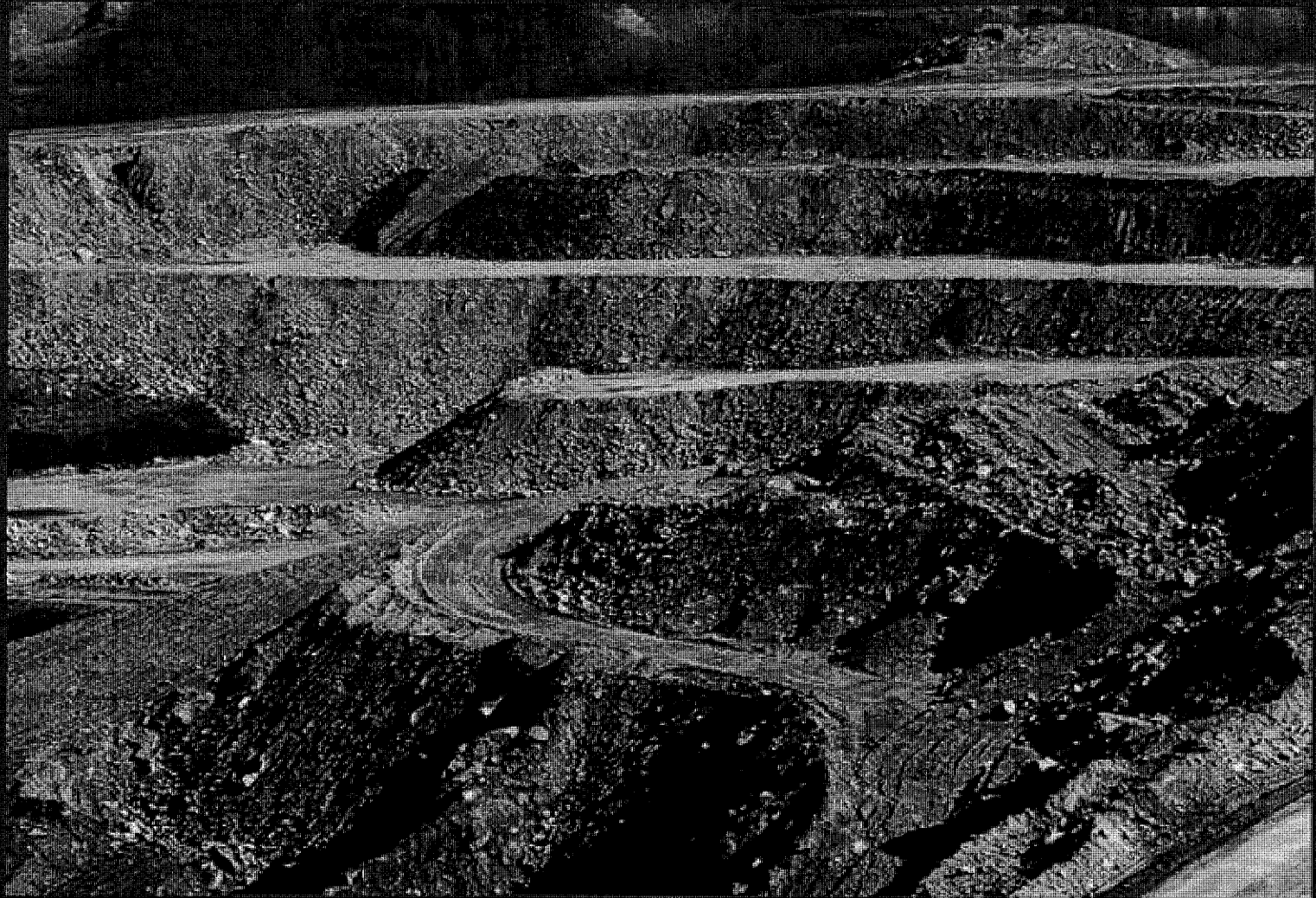
Thunder Ridge Mine, Hazard, KY